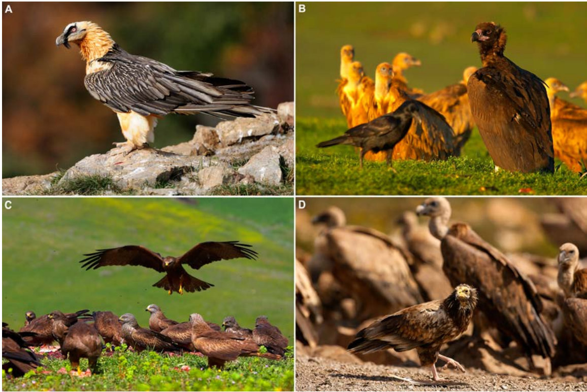
Fig. S1. Vultures and other avian scavengers at feeding stations in Spain. (A) A Bearded and a Cinereous Vulture among Griffon Vultures. (B) Cinereous Vulture and Common Raven and Griffon Vultures in the background. (C) Black Kites. (D) Egyptian Vulture with Griffon Vultures in the background.