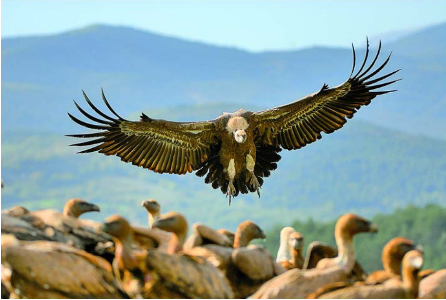
Griffon Vultures at a feeding station in Lleida, Spain.